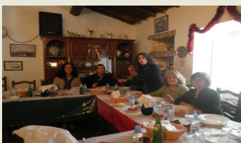
The Associação de Idosos da Malagueira, Popular Associative Movement Association in Évora received us to lunch with delicious Alentejo gastronomy and typical