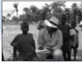
Reporting on violations, crises & cases