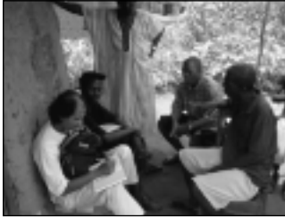
Country monitoring missions