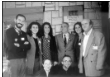
Staff at the Kosovo Rehabilitation Centre for Torture Victims have helped more than 8,000 victims of torture.

In connection with the return of the Kosovo-Albanian refugees, the Kosovo Rehabilitation Centre for Torture Victims (KRCT) was founded in Pristina 1999, with the assistance of the IRCT. To date, the KRCT and its six satellites throughout Kosovo have provided treatment to more than 8,000 victims of torture and related human rights violations. The establishment of the KRCT was financially supported by ECHO and is today supported by DANIDA. On 26 June 2000, the UN International Day in Support of Torture Victims, the KRCT and IRCT organised a global event at which members of Kosovo civil society and the international community signed the 'Prishtina Declaration on National Psychosocial Rehabilitation, Peaceful Co-existence and Prevention of Torture'. The Declaration recognised the needs of victims of torture and extreme trauma in a post-conflict society.