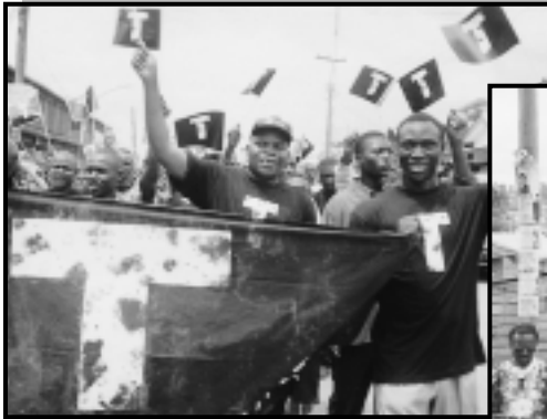
Commemorating 26 June worldwide