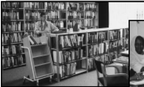
IRCT Documentation centre